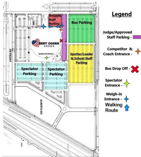
FIGURE 2: Bus Route for Drop Off/Pick Up & Designated Bus Parking